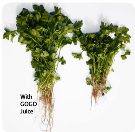
GOGO Juice trial results on parsley at Virginia in South Australia.

"Just try it" and judge its performance for yourself!