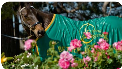
Better Loosen Up smells the roses